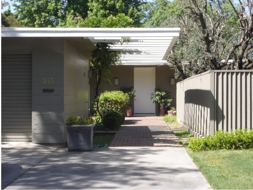
Heckendorf House, photo taken spring 2011